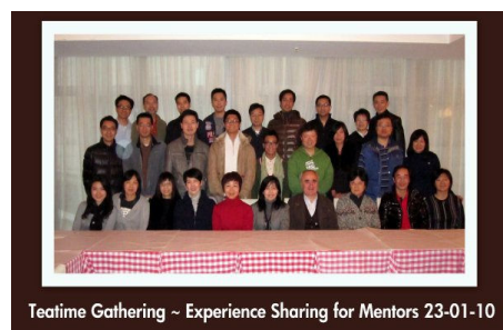
Teatime Gathering ~ Experience Sharing for Mentors 23-01-10

If you are interested to support our Mentorship Program, please directly deposit your donations into RHSOSA's HSBC bank account (Account #: 002-0-191581) and inform us the date and the amount of your deposit by email to mentorship@rhsosa.org