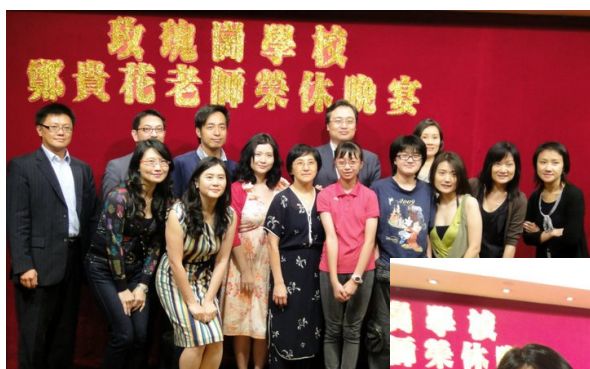
Primary Graduates from Different Years!