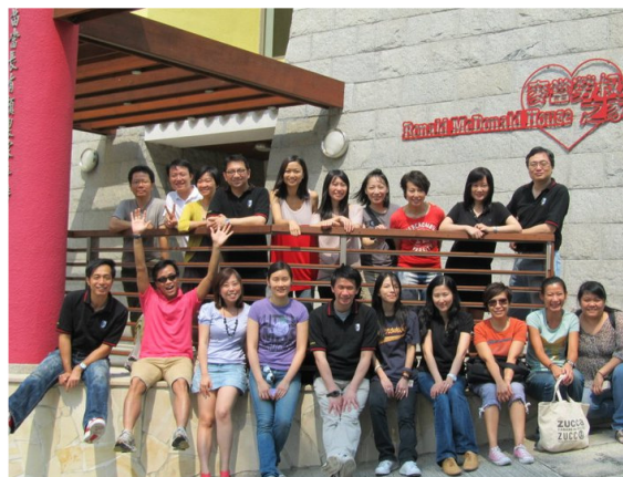
OSA x Ronald McDonald House