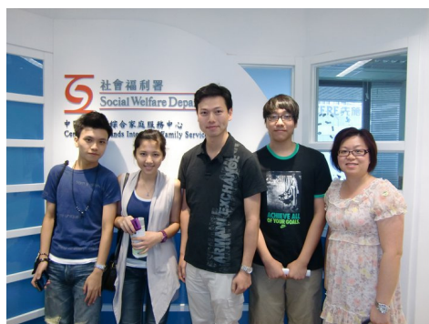
S5 & S6 mentees at Social Welfare Department

There was a famous old song named “Whatever will be, will be”. The starting of the song was like this - “When I was just a little girl, I asked my mother, what will I be”, and it ended like this - “The future’s not ours, to see... What will be, will be”. Doris Day did not know her song would become one of the most popular and long lasting songs; our students will not know what profession they will end up doing in the future.