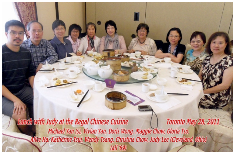
Class of '69 in Toronto, Canada on May 28, 2011