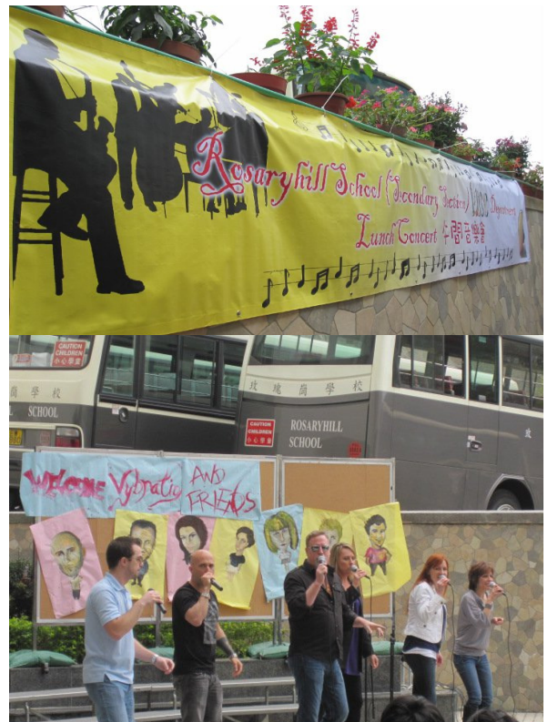
S6 Visual Arts 學生於當天早上在短時間內完成的畫作！