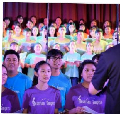
Rainbow connection II concert