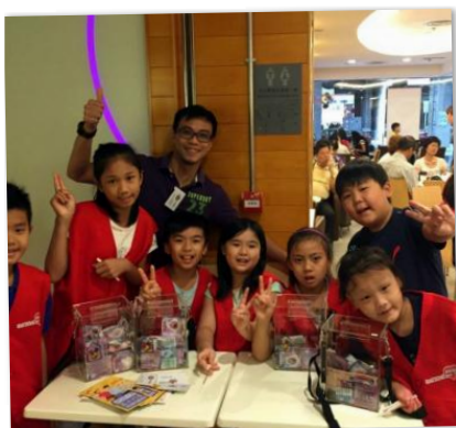
Raffle ticket sales for Ronald McDonald house