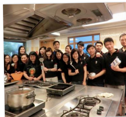
Meal preparation for Ronald McDonald House